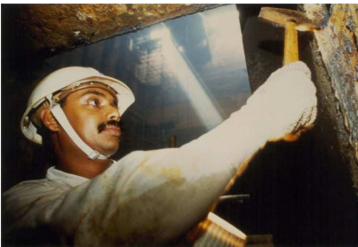
Tank Inspection Course