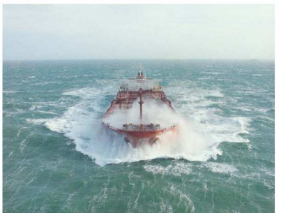
Hull Inspection Manual Tankers

Inspection guidance, reporting and rating system for Hull Structure